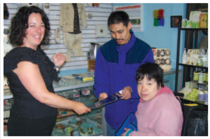
We Are Consumers

Referrals through and funded by: Yellowknife Health and Social Services Authority