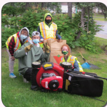
Odd Job Lawncare Pg. 6