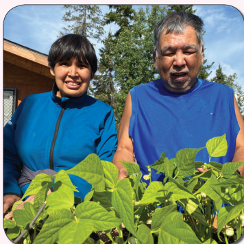
DIY fresh greens: Pg. 9