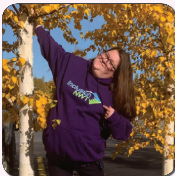
We are hiring: Pg. 2