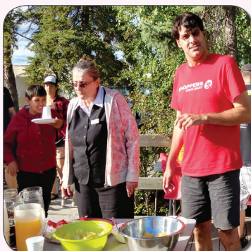
Board vacancy: Pg. 4