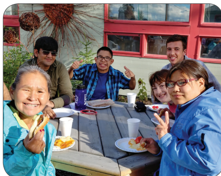
CLIENTS AND STAFF attend the Inclusion NWT BBQ in 2017.