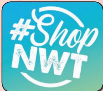
Scan 2 Win Pg. 7