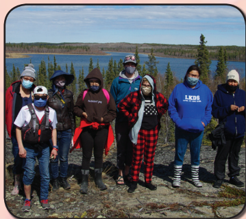
On-the-land learning: Pg. 2