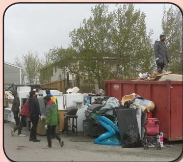
Working in Northlands: Pg. 5