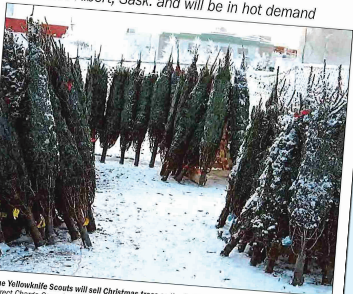
The Yellowknife Scouts will sell Christmas trees as the first batch of supply are to reach Yellowknife Direct Charge Co-op by the end of the month.

The Odd Job Squad will also be offering pick-up service at a later date for that service can be made in late December or early January. Inclusion NWT will be providing additional information at a later date.