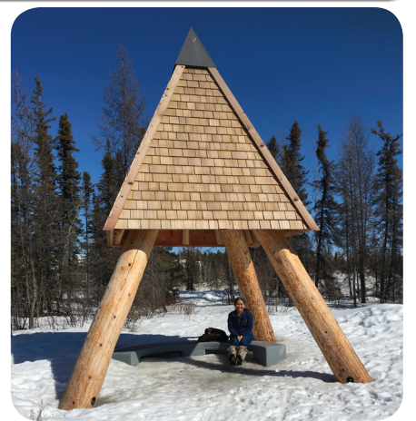
Bertha Taylor visited Rotary Park with staff.

Inclusion NWT offices are closed while staff continue to provide essential services to clients, with an abundance of caution.