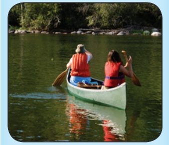
SUMMER YOUTH Program participants head out on a canoe adventure tomorrow.